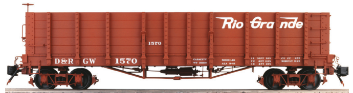
D&RGW FLYING RIO GRANDE