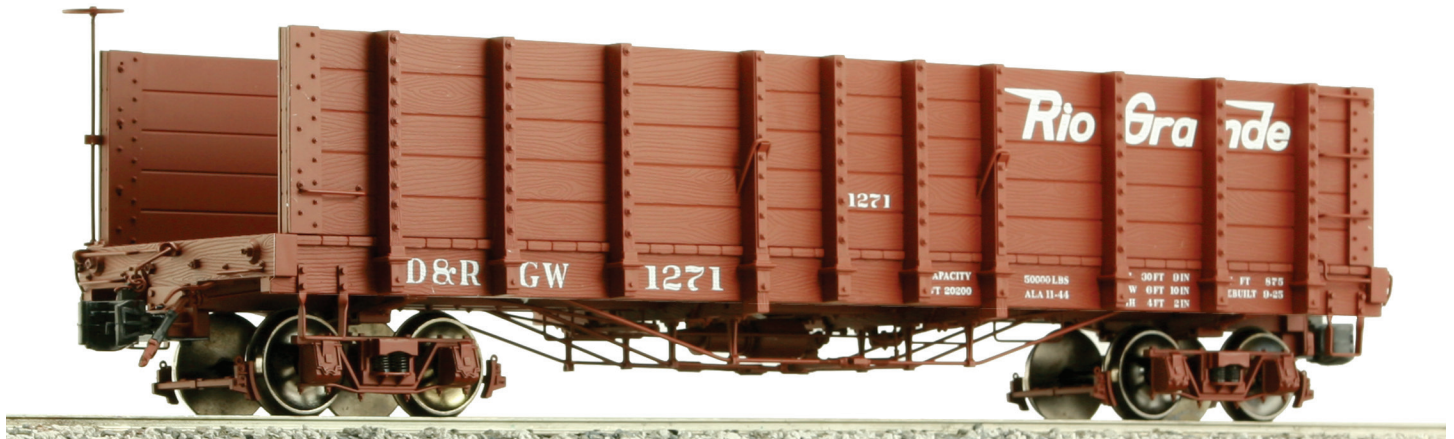
D&RGW FLYING RIO GRANDE